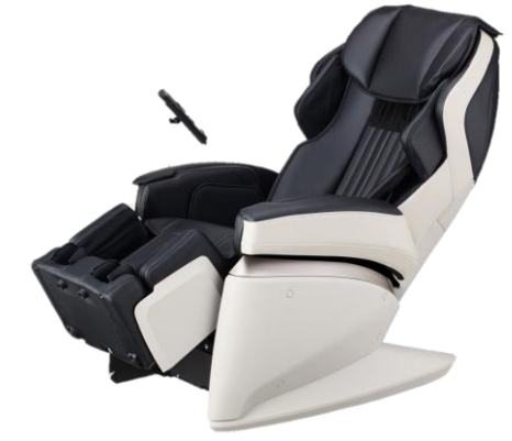
High-end massage chair " AS-1000 " *launched in November 2015